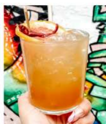
Notorious Cocktail w/ Proper Twelve Whiskey