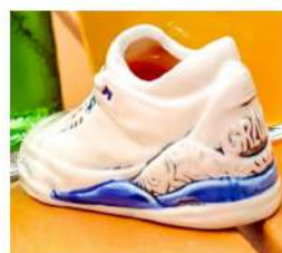
Lucky Sneaker Shot Keep the Souvenir Shot Glass!