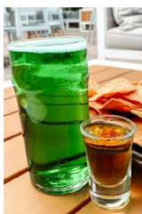
Boilermaker Green Beer + Shot