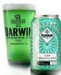
Cyan Pineapple Sour Pineapple Sour Beer