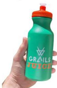
Grails Lucky Juice XL Cocktail in Souvenir Bottle