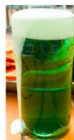
"Grails" Green Beer Limited-time Beer