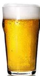
House Lager (Draft) House Lager