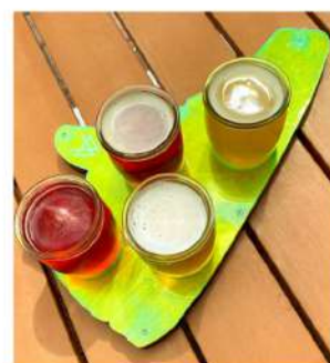
Four Beer Flight Choose any 4 beers